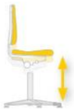
Seat height adjustment