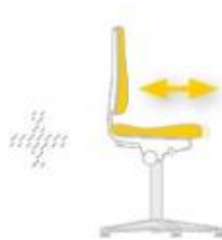
Seat depth adjustment