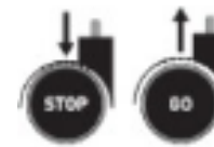
ESD stop and go castors