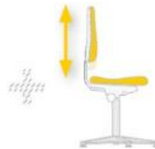
Backrest height adjustment