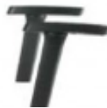
Multifunction ESD armrest