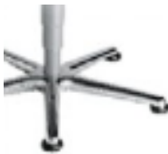
Polished aluminium 5 star base