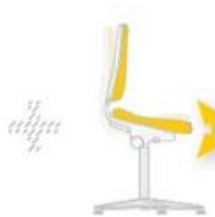
Seat tilt adjustment